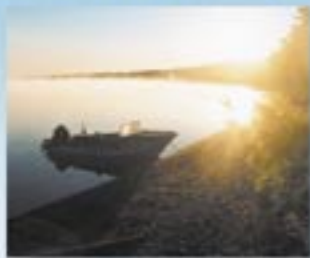
Boating on 8 lakes!