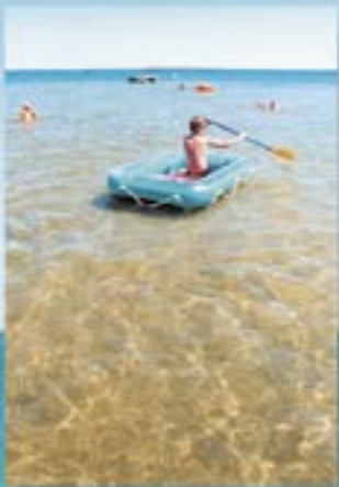
Fabulous sand beach!