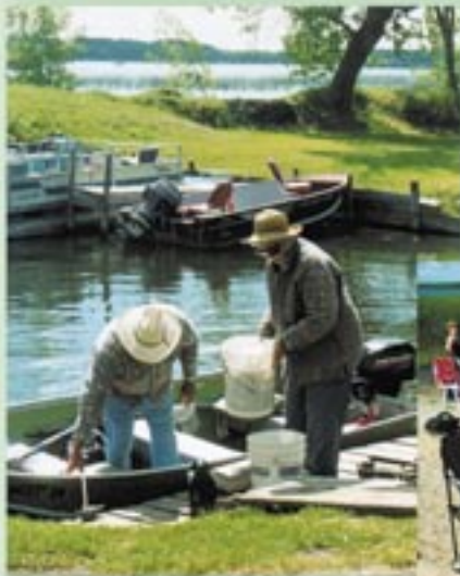
Fun for all ages!