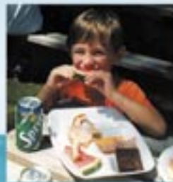
Meetings and family reunions